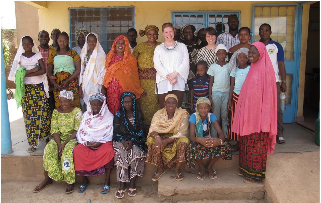
Fig 1. Meeting with women's cooperatives, Fada-Ngourma, Burkina Faso, 2015