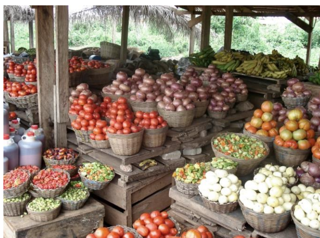
Fig. 3 Raw materials for West African green food products, Ghana

The GreenGrowth project, has with its West African and Danish partners, its infrastructure, project management and excellent productive collaboration among all partners, been very effective in meeting the objectives defined and agreed upon. It has been demonstrated for the selected food value chains that traditional fermented West African food can be a driver of sustainable food production, by introducing green processing methods by use of starter cultures, upgrading the entire value chain and implementing new business models for income generation and employment.