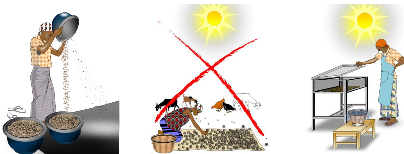
Fig. 2 Illustrations from pictorial for proper production of fermented food, Burkina Faso

Traditional fermented food products have held a vital position in the West African diet for several centuries. Preserving these traditional foods is therefore vital for meeting the nutritional needs of all ages of the population, as well as for ensuring food security, alleviating poverty, developing local businesses, providing job creation and implementing green processing strategies. As the traditional food culture and diets