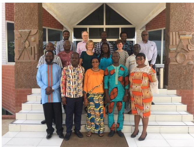
Fig. 5 GreenGrowth consortium meeting, Cotonou, Benin, 2018

The GreenGrowth project, together with previous projects in West Africa, has successfully developed regional research and educational collaboration within food science, which needs to be supported and sustained. The West African and Danish scientists together form a strong network with high capabilities at international level for research and education in food science and technology.