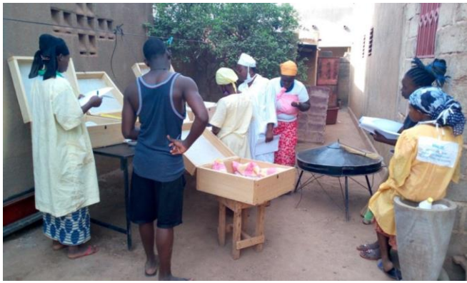
Fig. 4 Sensorial evaluation of fermented food made by starter cultures at SME level, Ouagadougou, Burkina Faso, 2017

A sustainable laboratory infrastructure and internationally accepted procedures were established for preserving the West African biodiversity of potential starter cultures in three national culture collections in Ghana, Burkina Faso and Benin managed by the African partners in an open collaboration with fully shared responsibility and ownership. As a consequence, interest was raised in the SMEs for using starter cultures and to implement food safety and quality management. Additionally, the project pointed out the need for further work to develop bio-degradable packing for fermented food.