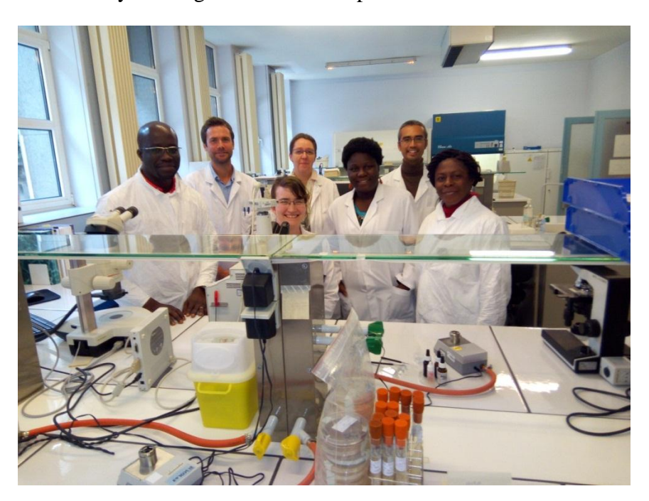
Fig. 4: Photo with the minor fungi trainer

The last day training ended around 5 pm.