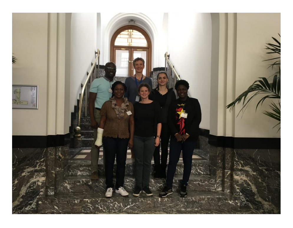
Fig. 3: Photo with the team of Mycobacteriology Unit at ITM